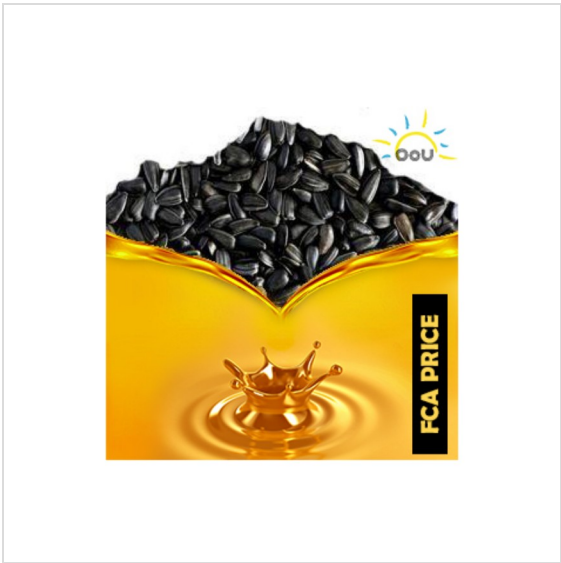
Crude edible oil 1MT (FCA price)

Crude Sunflower Oil Crude edible oil 1MT (FCA price)